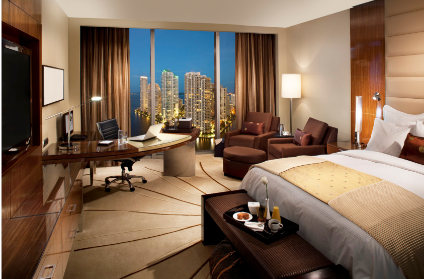
Best Western International